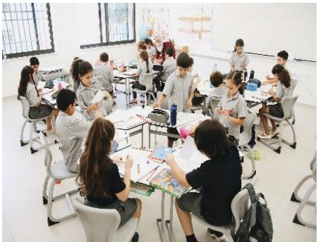
Third graders moved to their new learning communities this fall in the newly constructed third floor on top of the KG building at the Lower campus.