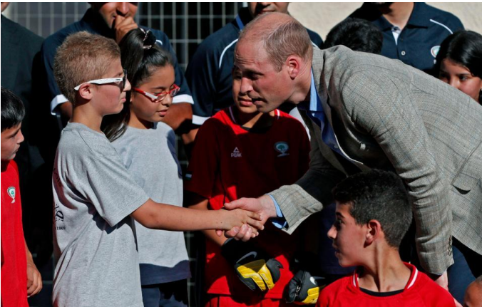
His RH Prince William shakes hands with RFS students during his visit.