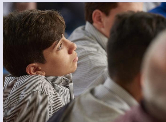
Middle School students during their first Silent Meeting

An important feature of a Friends education is the concept of silence. This year throughout the school silent meeting has become a regular part of the school week. We gather together each week for shared silent meeting. Silent meeting offers our students valuable opportunities