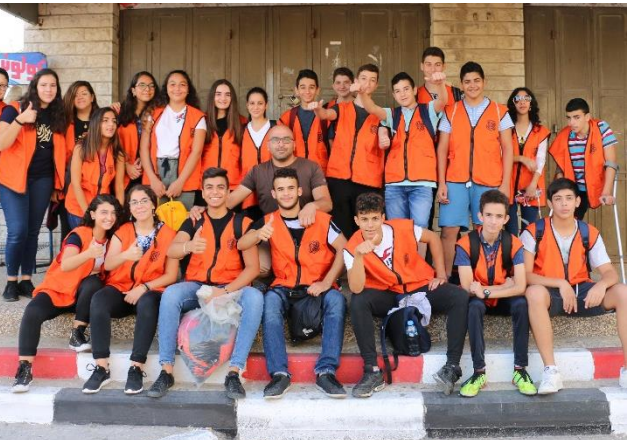
Upper School students participated in community service in September.

Working hard, together, enables all of us to become better at what we each do, teaching, parenting, learning, communicating...Being RFS. The question I wish to pose to all of us at the beginning of the year, how much are we acting like a community? And how can we get better at it? Something to reflect on as we embark on a new learning journey together. Wishing each and every member of our community a year full of learning.*