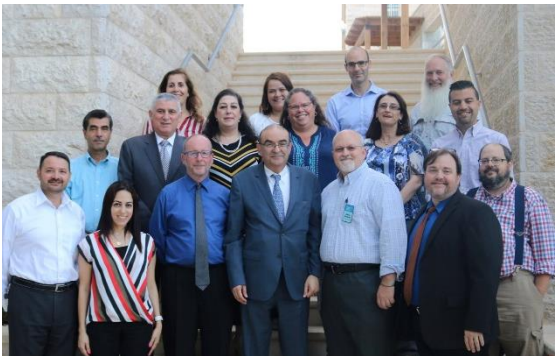
Board of Trustees and RFS administration met with FUM General Secretary and delegation during their visit to Ramallah in September.