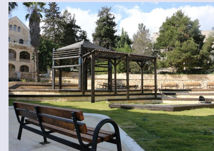
Upper School Quad November 2018