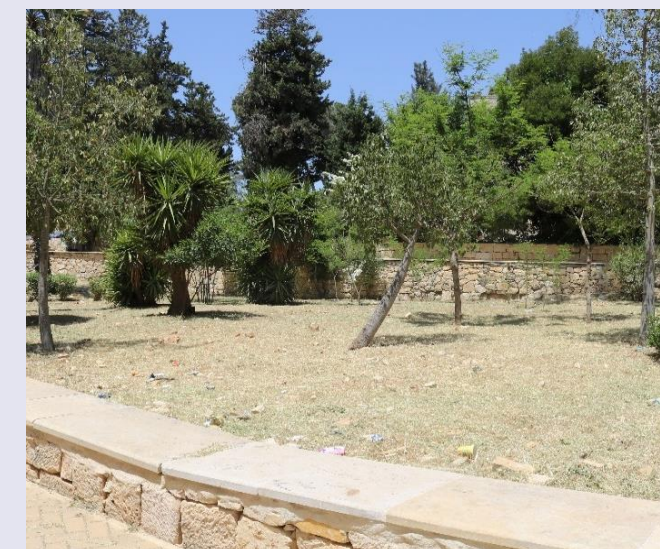
Area were the Quad was constructed on Upper Campus - before construction.

- Pavement and expansion of internal vehicle lane next to the Science Building, paving it with artificial interlock blocks.